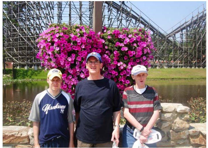
Clients enjoyed both Six Flags in New Jersey, above & left, and the more local Six Flags New England park, below, over the summer.