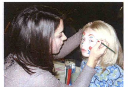
Qualified, nurturing staff

West Haven Community House 227 Elm Street West Haven, CT 06516 www.whcommunityhouse.org