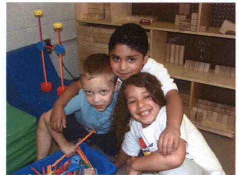
Choice of activities