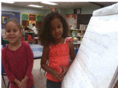
Safe & creative environment